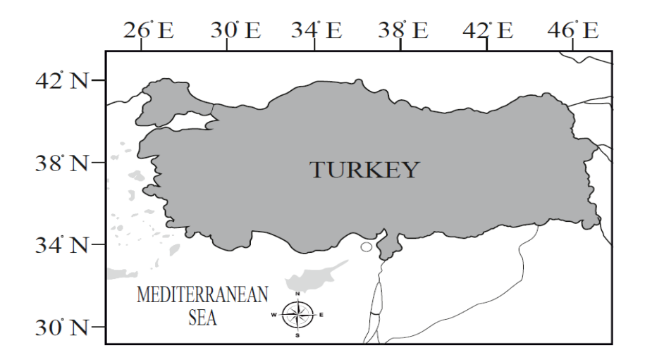
Figure 1. Sampling area (O), Northeastern Mediterranean sea

Trigloporus lastoviza individuals were captured by commercial bottom trawler at a depth of 155 to 212m off the Iskenderun Bay (36^{\circ}13^{\circ}650 \text{ N-}035^{\circ}23^{\circ}032 \text{ E}, 36^{\circ}16^{\circ}622 \text{ N-}035^{\circ}18^{\prime}509 \text{ E}) in 2015 fishing season (Figure 1). A total of 84 specimens (52 females and 32 males) were collected and transported to the laboratory on ice. Each fish was measured for total length to the nearest 0.1cm, weight (W) was weighted to the nearest 0.1g and the sex was determined by macroscopic observation of the gonads at the laboratory in F1rat University. In the length-weight equation "a" and "b" are intercept and the slope (=exponent) of the length-weight curve, respectively. Data were subjected to statistics analysis by using the IBM SPSS Statistics ver. 22.0 for Windows. Total lengths and weights were fitted to the length-weight equation: W=aLb, by using least square methods with Statistical software [14]. The "b" value for this species was tested by a t-test at the 0.01 significance level to verify if it was significantly different from 3 [15].