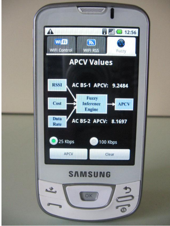
Figure 3. Wi-Fi fuzzy logic based handoff interface (Şekil 3. Wi-Fi bulanık mantık tabanlı el değiştirme ara yüzü)

Results of the scanning access point contain enough information (i.e. frequency, RSS level, SSID, BSSID, capabilities) to make decisions about what access point to connect to [6]. In addition to those classes, several classes and their methods are available in the Android libraries.