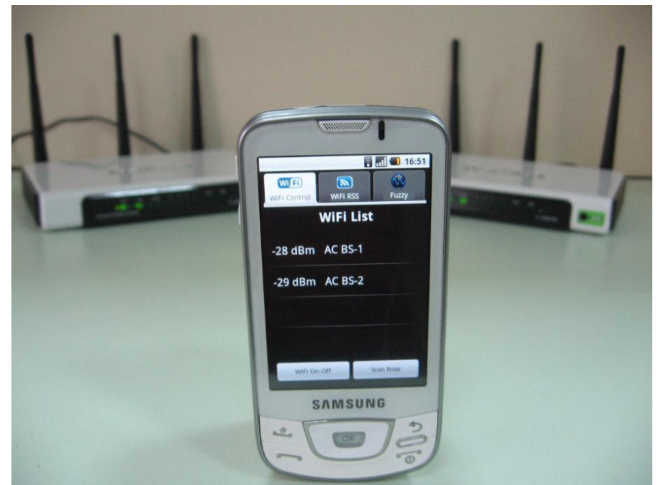
Figure 1. Android phone with the application and Wi-Fi APs (Şekil 1. Android telefon, Wi-Fi erişim noktaları ve uygulama)

In the first tab, available Wi-Fi APs are controlled and managed easily. The user can enable or disable Wi-Fi function of phone and select one of Wi-Fi APs listed to connect. Wi-Fi APs are arranged in order of RSS as shown in Figure 1. Using the second tab, users can observe RSS information of APs found with a graphical presentation. In this activity, mobile phone scans the environment for every second and the graphic is updated periodically. This activity is shown in Figure 2.