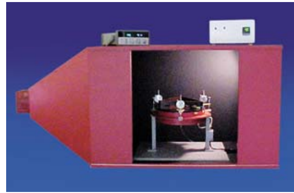
Figure 1. Shirley Togmeter (Şekil 1. Shirley Togmeter)