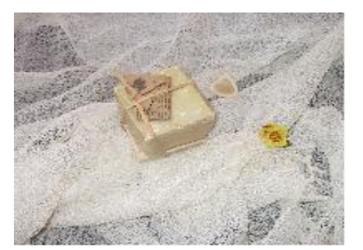
Resim 2. Laundry box and decorative mask (Picture 2. Çamaşırlık ve dekoratif örtü)