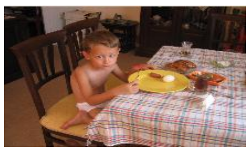
Resim 4. Dish towel and table cloth (Picture 4. Kurulama bezleri ve masa örtüsü)