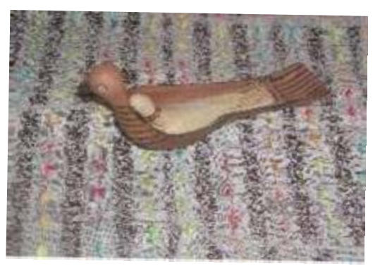
Resim 1. Multi-purpose decorative covers (Picture 1. Çok amaçlı dekoratif örtüler)