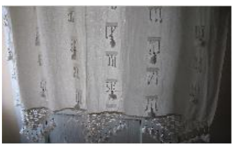
Resim 3. Pike and curtains (Picture 3. Pikeler ve Perde)